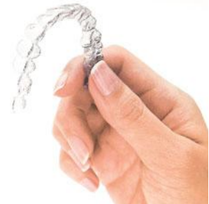
Invisalign Removable Clear Aligners